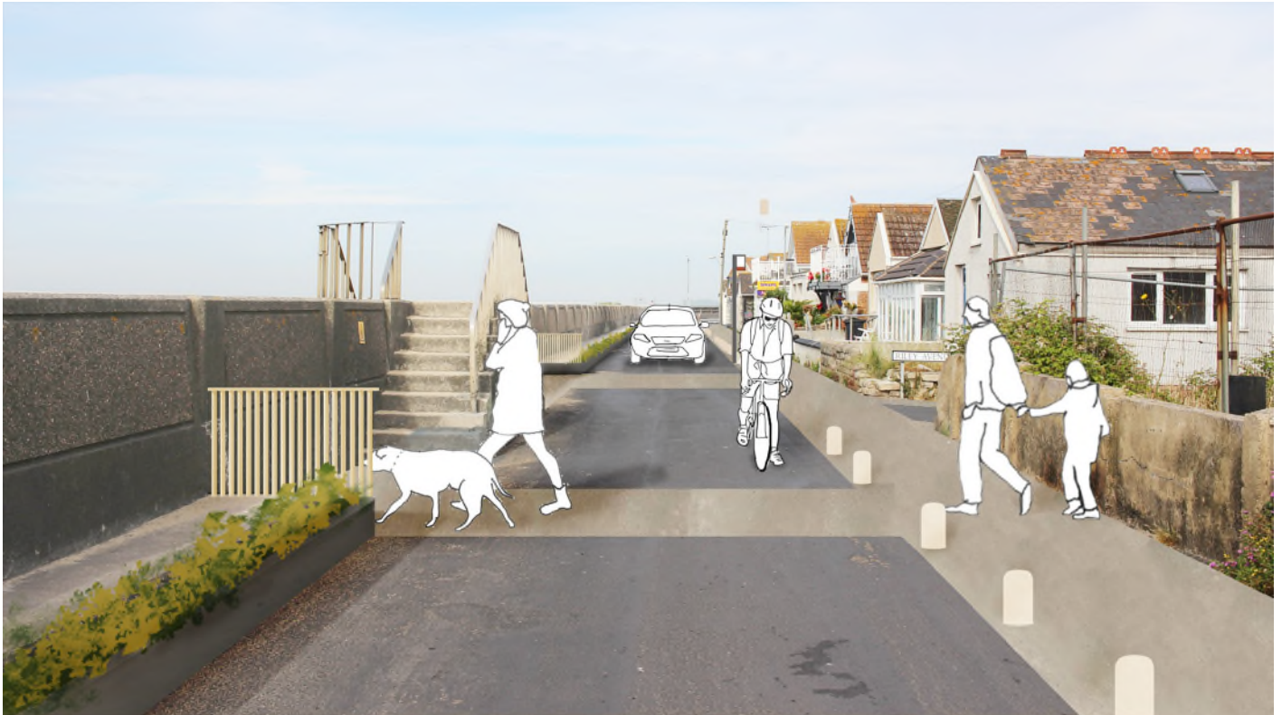
Visualisation showing the nationally preferred option

The preferred option for upgraded flood defences, integrating new public realm, improved beach accessibility, and new facilities, requires a funding commitment of around £108m at 2023 values. If delivery is planned for after 2033, when national Flood Defence Grant in Aid (FDGiA) benefits can be drawn down to part-fund the scheme, the partnership funding required may be around £84m at 2023 values.