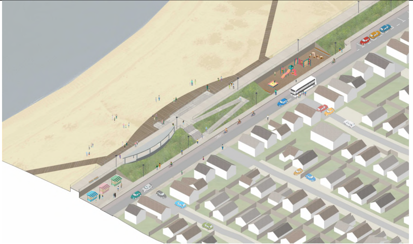
.Isometric sketch showing the main elements of the proposed seafront design strategy along the Brooklands