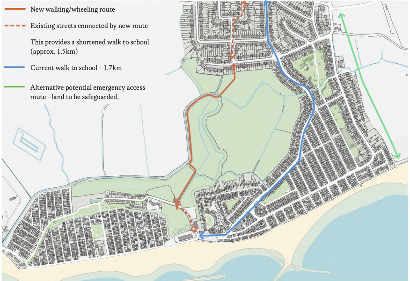
Map showing proposed new route and alternative emergency access route to be safeguarded.