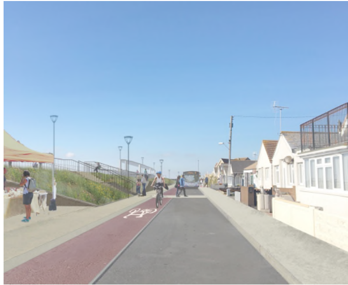
Sketch visualisation of the proposed new seafront design strategy along the Brooklands seafront